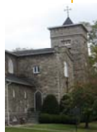
St. Luke's, Smethport

February 21st - St. Augustine, Edinboro February 28th - St. Luke's, Smethport